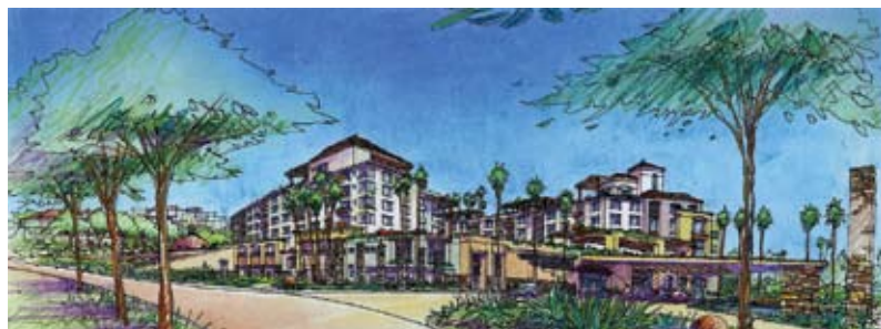
Multi-Family Residential Perspective