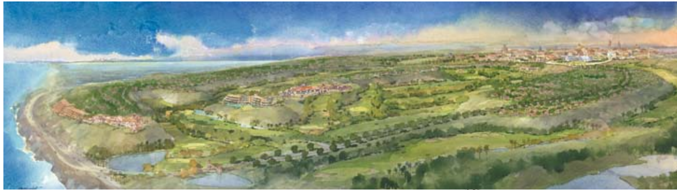
La Joya del Pacifico Rendering