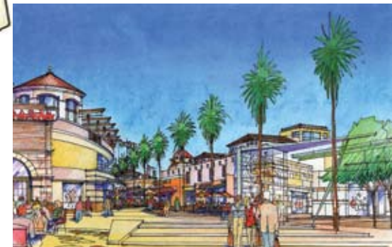
Mixed Use Retail Plaza Perspective