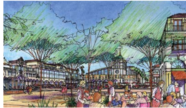
Commercial - Civic District Plaza Perspective