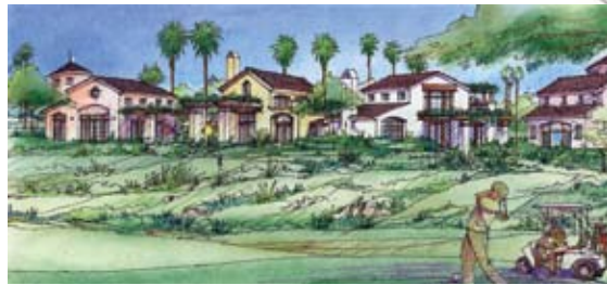
Single Family Golf Course Frontage Perspective