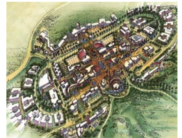
Village Core Aerial Perspective