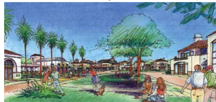
Neighborhood Commercial Perspective